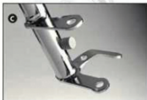
PINLOCK BRACKET CLOSE-UP